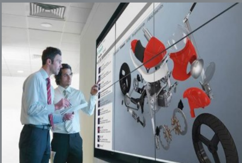
A comprehensive overview of Teamcenter is done with our technicians