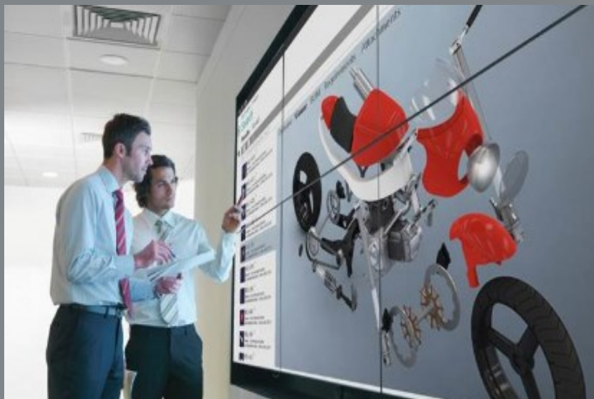
A comprehensive overview of Teamcenter is done with our technicians