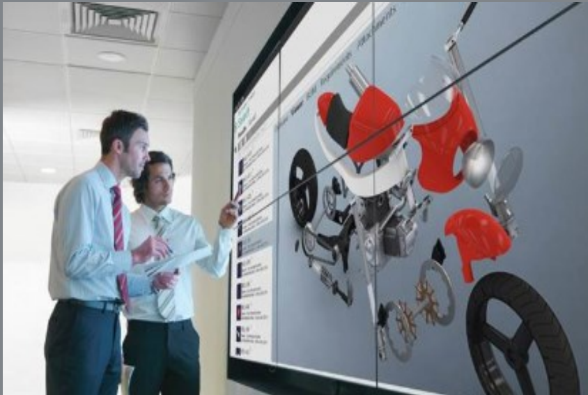
A comprehensive overview of Teamcenter is done with our technicians